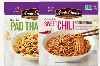
Annie Chun's Instant Noodle Bowls 5.9-8.5oz; all flavors