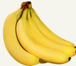
DNF Produce Organic Bananas Per LB