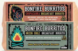
Bonfire Burritos Frozen Burritos 10.3oz; all flavors