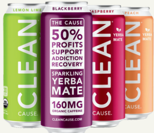
Clean Cause Sparkling Yerba Mate 13oz; all flavors